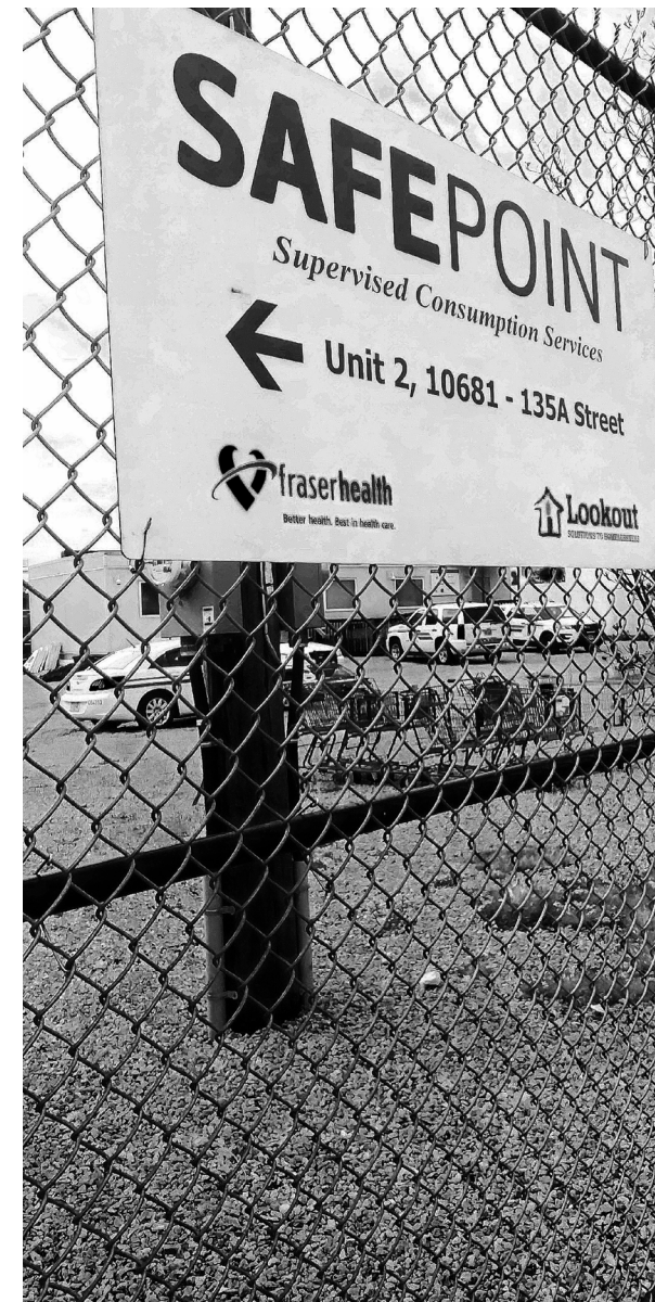
Sign for Safepoint, the safe injection facility on the Strip, in front of the cop trailers.,April 2018.